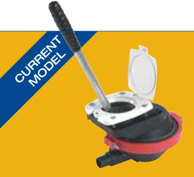
Pictured with Deckplate AS0356